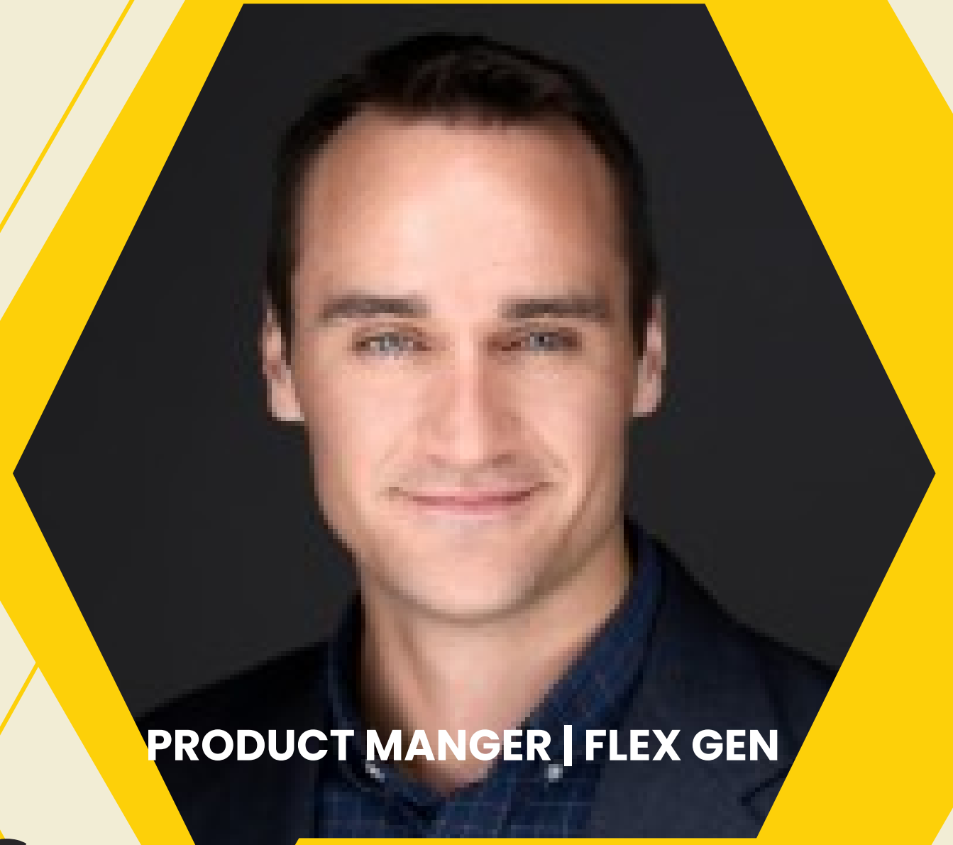
PRODUCT MANGER | FLEX GEN