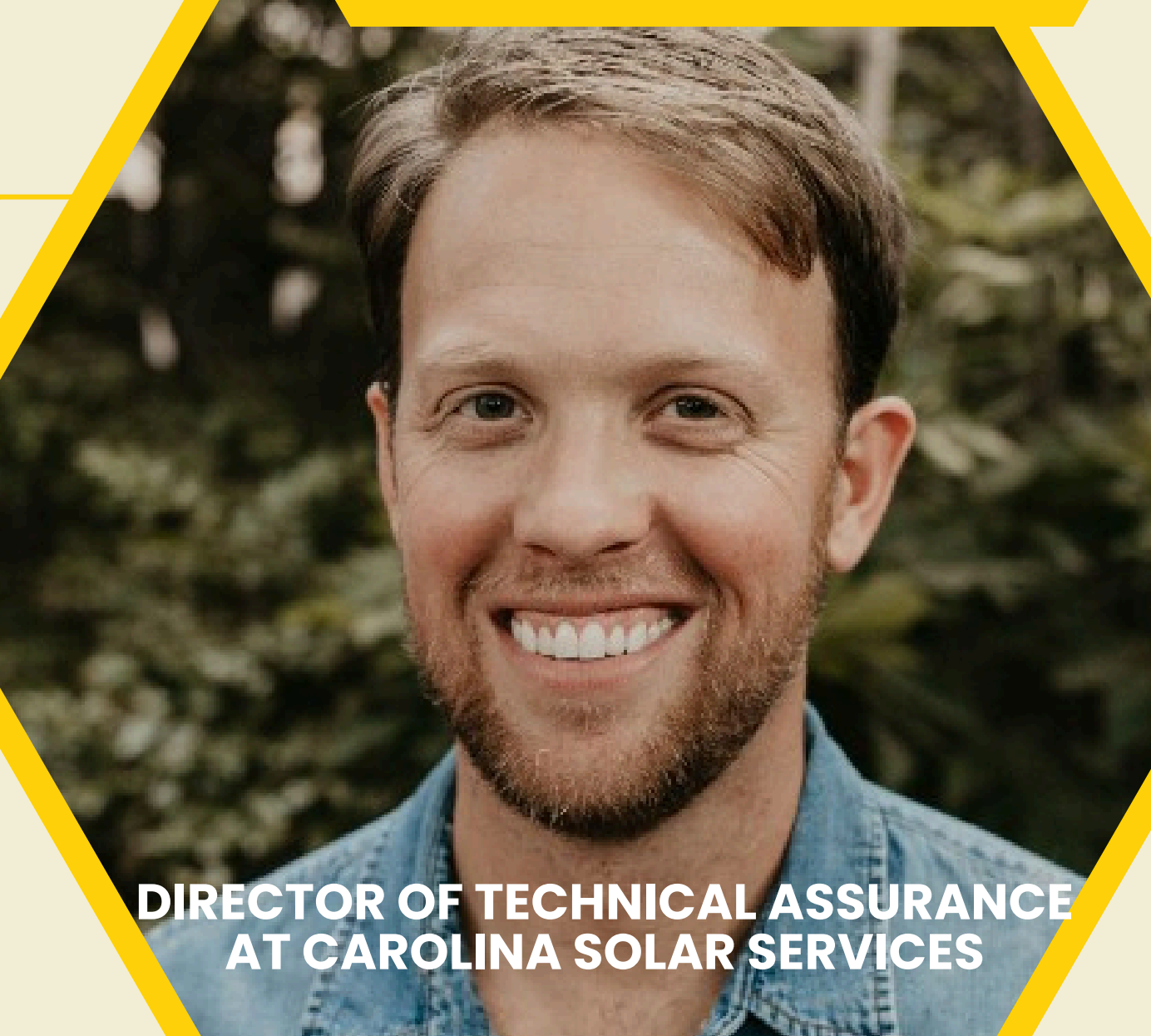
DIRECTOR OF TECHNICAL ASSURANCE AT CAROLINA SOLAR SERVICES